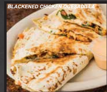
BLACKENED CHICKEN QUESADILLA