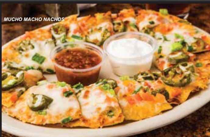
MUCHO MACHO NACHOS

MUCHO MACHO NACHOS • $9.99 WITH CHICKEN • $12.99 | WITH BEEF • $13.99 TOPPED WITH REFRIED BEANS, MOZZARELLA & CHEDDAR CHEESE, JALAPENOS, TOMATOES, & CHIVES