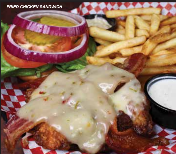
FRIED CHICKEN SANDWICH

GRILLED STEAK OR CHICKEN TOPPED WITH WHITE AMERICAN CHEESE, GRILLED ONIONS, PEPPERS, & MUSHROOMS. SERVED ON A HOAGIE *ADD QUESO AND JALAPENOS TO MAKE IT A TEXAS PHILLY FOR $2.00